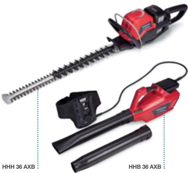
HHH 36 AXB